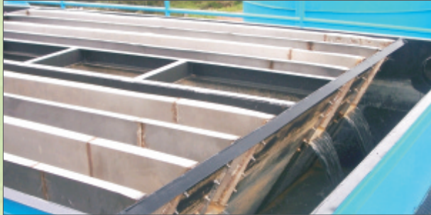
Top view of inclined plate clarifier