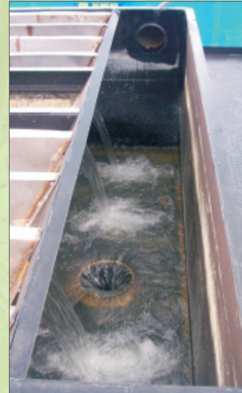
Treated water flows out from flow distributing outlet flumes